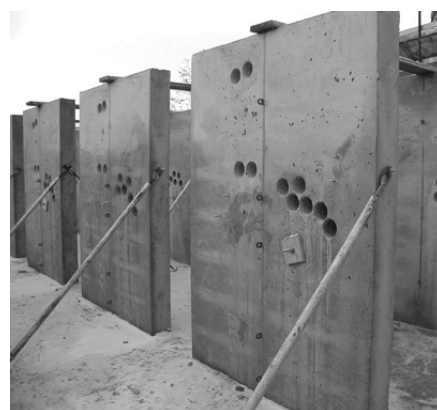
Figure 3: The remaining wall segments following core sampling to compare to the cylinders taken during placement.