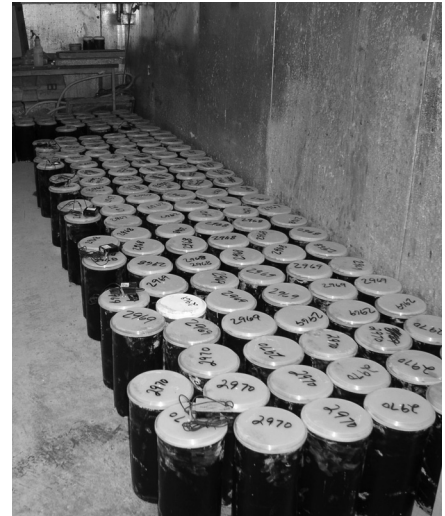
Figure 1: The refrigerated test chamber at Master Builder’s laboratory in Cleveland, OH with all cylinders from Phase I ready for testing. Note the maturity meters in cylinder 1 of each set.