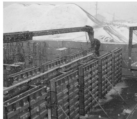
Figure 2: Placement conditions for the full scale walls in Phase 2 included temperatures of 26°F and falling along with active frozen precipitation.